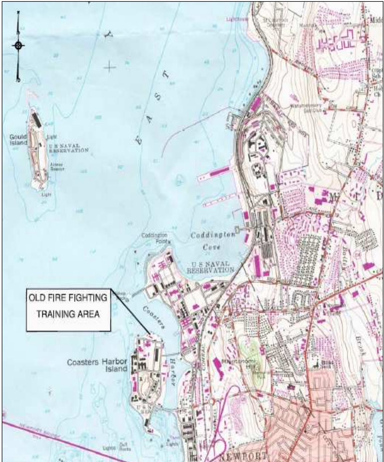
Figure 1 – Site Location at the northern end of Coasters Harbor Island.