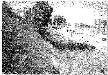
A geotextile tube dewatering behind Harbor West Marina.

Great Lakes Harbor Management performs marina maintenance on Harbor West Marina in Traverse City, Michigan. Utilizing an IMS Model 4010 VERSİ DREDGE® , Great Lakes Harbor Management filled 45' x 200' geotextile bags manufactured by Synthetic Industries.